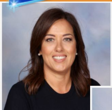
PA to the Principal/School Secretary